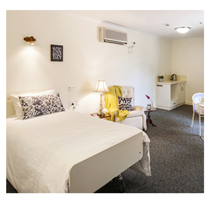
Extra Large Single Room Cost $875,000