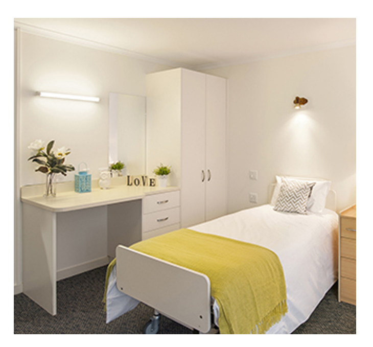
Large Single Private Room Cost $750,000