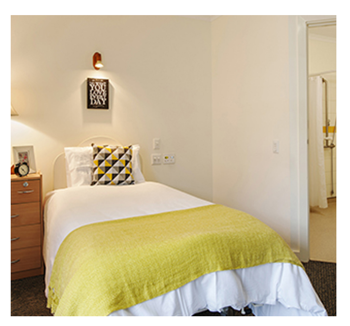
Single Private Room Cost