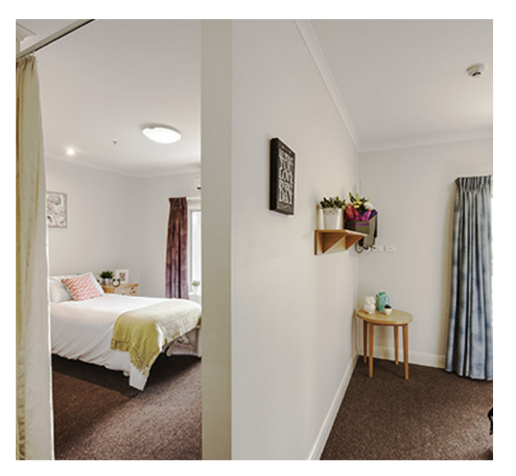
Companion Room - 2 Bed - Private -Large Room Cost