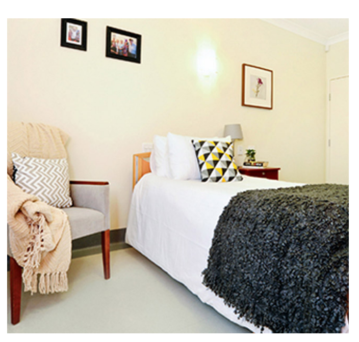
Single Room Private Room Cost $370,000