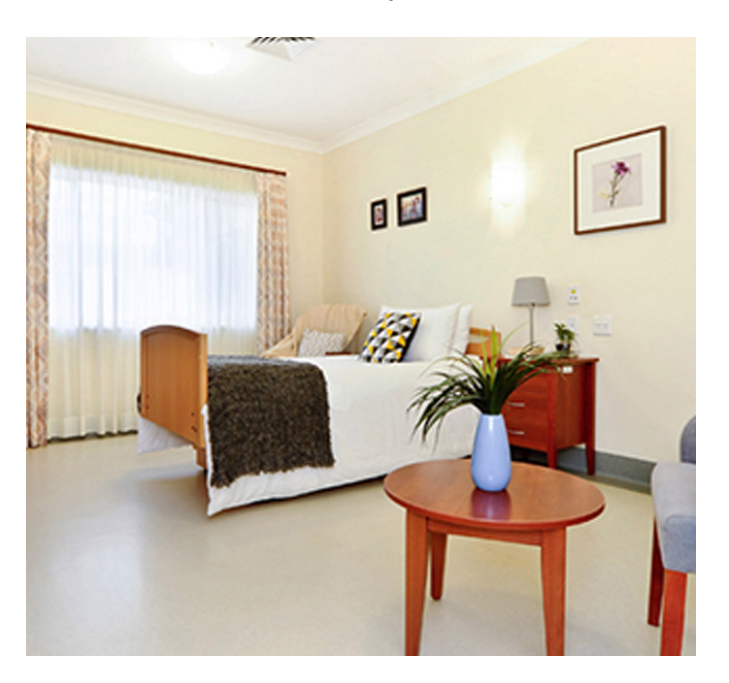
Single Room Large Room Cost $460,000