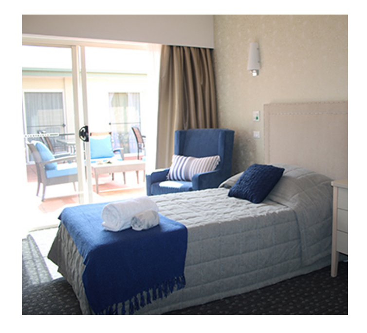
Large Single Private Room Cost $680,000

Services and support designed to optimise your health and wellbeing.